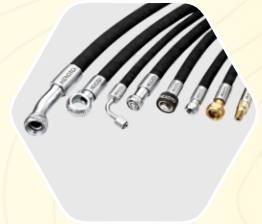
Hydraulic Hose Pipe

SIZE : 1/4" TO 4" AVAILABLE : RUBBER HOSE AS PER REQUIREMENT TEMP : 50c. TO 350c CLAMP : FLANGE CONNECTION, THREAD CONNECTION, PUSH FITTING MEDIA : STEAM HOSE, WATER, FLUID OIL, HOT OIL