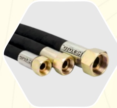
Steam Hose Pipe