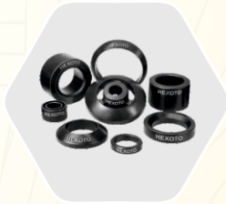
Carbon Graphite Product